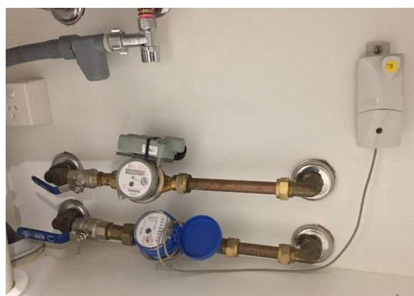
Cold and hot water sub-meters with remote reading devices. Hot water meter in this case is read by the Corporation's gas provider (for gas billing purposes), the cold water meter is read by SWS. We obtain hot water reads from the gas provider to bill owners for total water usage