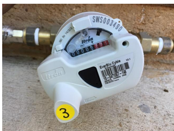
Itron 20mm cold water meter with Cyble attached (remote reading device)