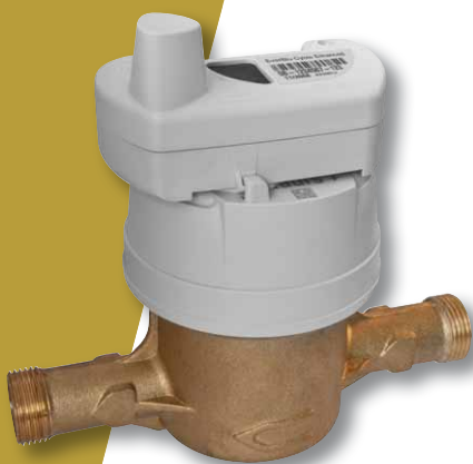
> EverBlu Cyble Enhanced fitted on Residential water meter