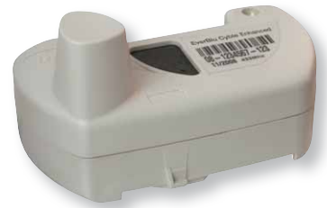
> EverBlu Cyble Enhanced