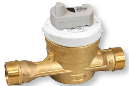
> EverBlu Cyble Enhanced fitted on Commercial and Industrial water meter