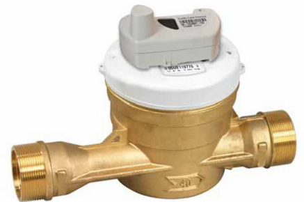
EverBlu Cyble Enhanced fitted on Commercial and Industrial water meter