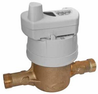
EverBlu Cyble Enhanced fitted on Residential water meter

The EverBlu Cyble Enhanced is suited to various applications for residential, commercial and industrial uses.