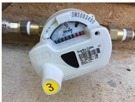
Itron 20mm cold water meter with Cyble attached (remote reading device)